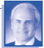
Frederick W. Smith

Through the dedication and performance of FedEx employees and Smith's unflagging commitment to service quality, FedEx has gained significant leadership recognition throughout the years. In 1990, FedEx was the first company to win the Malcolm Baldrige National Quality Award in the service category. FedEx is one of only 28 corporations to be included in Fortune magazine's "100 Best Companies to Work for in America" every year since the inception of the list. FedEx Corporation has also been included in "50 Best Companies for Minorities" (2001) and "America's Most Admired Companies" (2002). Computerworld has also named FedEx in its list of "100 Best Places to Work in IT" since 2001, and Forbes named Smith in their list of "Top CEOs" in 2001.